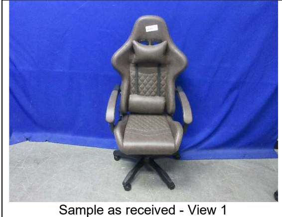
Sample as received - View 1