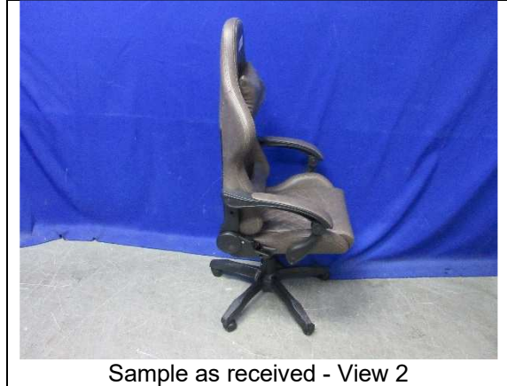
Sample as received - View 2