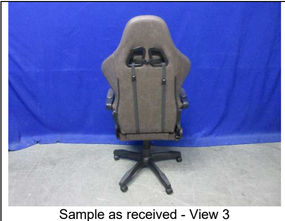
Sample as received - View 3