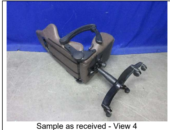
Sample as received - View 4

SGS authenticate the photo on original report only